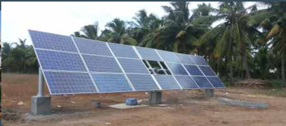
Single Axis Tracking System