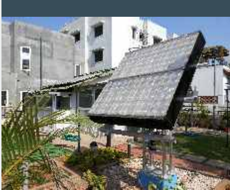
Dual Axis Tracking System